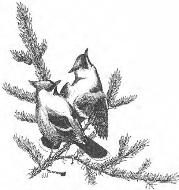
Bohemian Waxwings