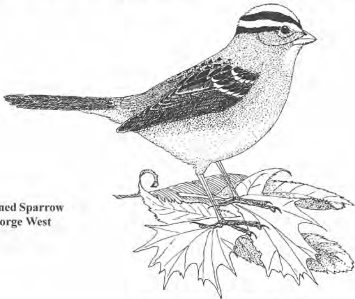
White-crowned Sparrow by George West